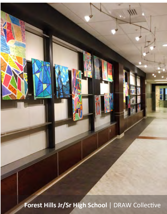
Forest Hills Jr/Sr High School | DRAW Collective