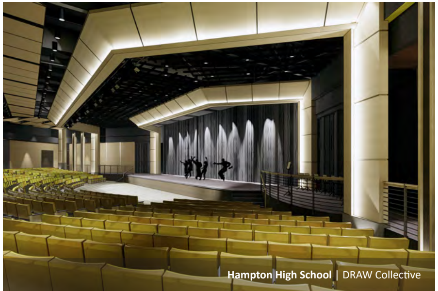
Hampton High School | DRAW Collective