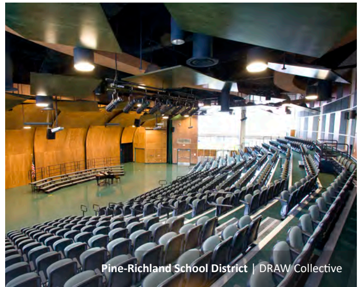
Pine-Richland School District | DRAW Collective